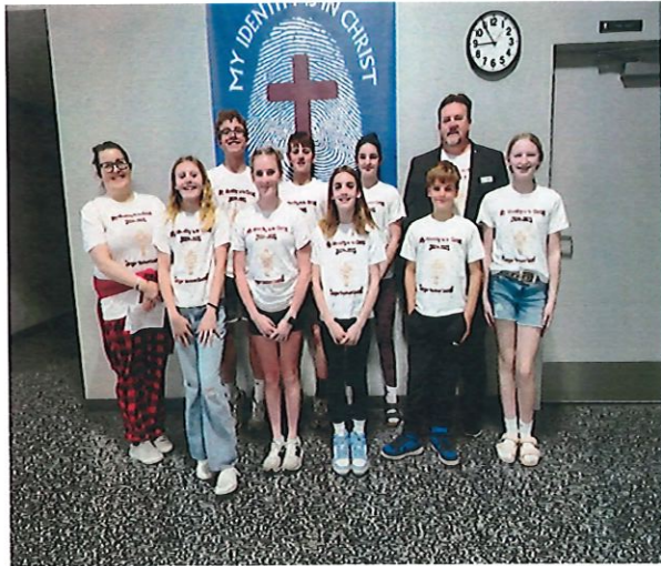
National Day of Prayer Chapell was led by our Student Council students today!