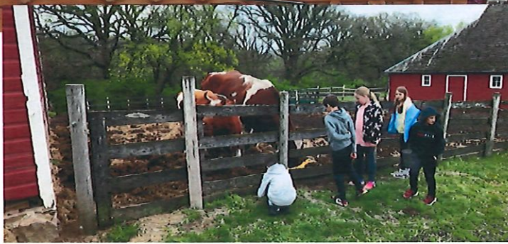
3 rd Grade participates in Farm Ag Day at the Benton County Fairgrounds. Thank you to the Benton Extension office and the local FFA students for sharing their wisdom and talents on the animals and farm safety!