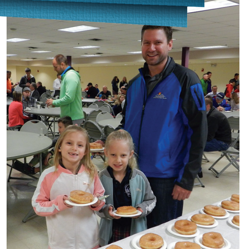
DONUTS WITH DAD