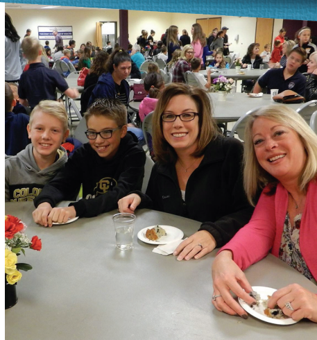
MUFFINS WITH MOM