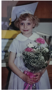
Me at my kindergarten graduation!