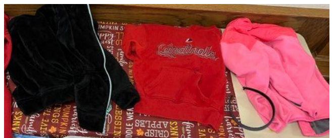
Current items in Lost and Found

These would make great stocking stuffers!