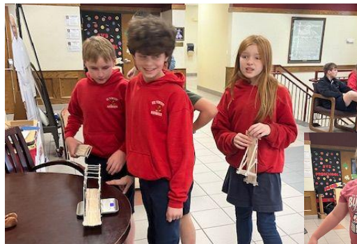
Project Based Learning in STEM class! (Bridge Design)

We are blessed that we have the opportunity to receive the Sacrament of Reconciliation today. It is a great support during our Lenten journey.