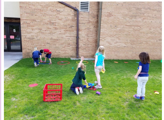
Early childhood field day. PK4–3rd grade