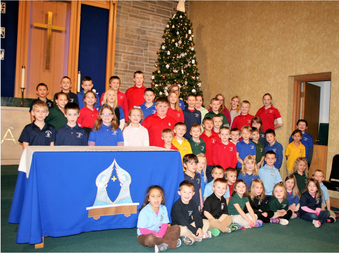
Merry Christmas From the Faculty, Staff and Students Of Trinity Lutheran Church and School Of Menasha, Wisconsin